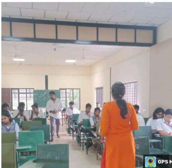
Check In Alappuzha, Kerala, India 8j52+w47, Mavelikkara - Chengannur - Kozhenchery Rd, Kerala 689121, India, Ala Kerala 689121, India Lat 9.309702° Long 76.600276° 15/07/2025 09:26 AM GMT +05:30