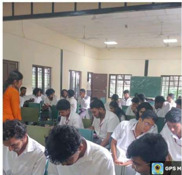
Check In Perissery, Kerala, India 8j52+j6m, Perissery, Kerala 689121, India Lat 9.309372° Long 76.600614° 15/07/2025 09:26 AM GMT +05:30