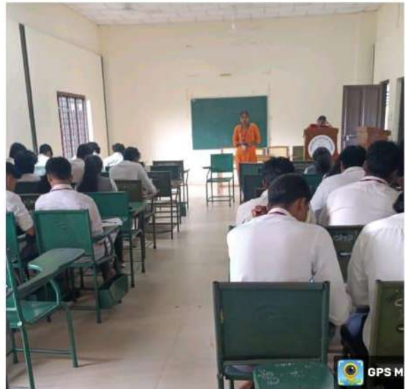
Check In Mavelikara, Kerala, India 8j52+w2w, Mavelikkara - Chengannur - Kozhenchery Rd, Mavelikara, Kerala 68912 Lat 9.30974° Long 76.600157° 15/07/2025 09:29 AM GMT +05:30