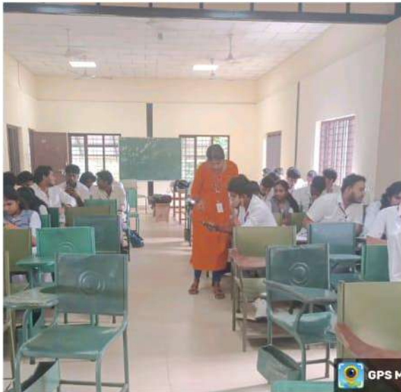
Check In Mavelikara, Kerala, India 8j52+w2w, Mavelikkara - Chengannur - Kozhenchery Rd, Mavelikara, Kerala 68912 Lat 9.309698° Long 76.600173° 15/07/2025 09:33 AM GMT +05:30